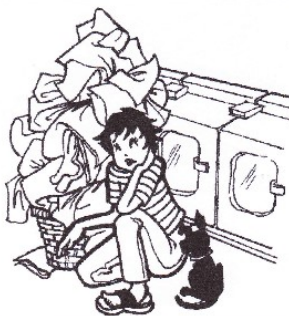
"My sponsor says I'm living in the wreckage of my future."

* GSR School & Literature Forum begin at 9:00 am !!!!